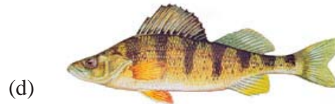
(a) Bluegill (b) Crappie (c) Large Mouth Bass (d) Yellow Perch