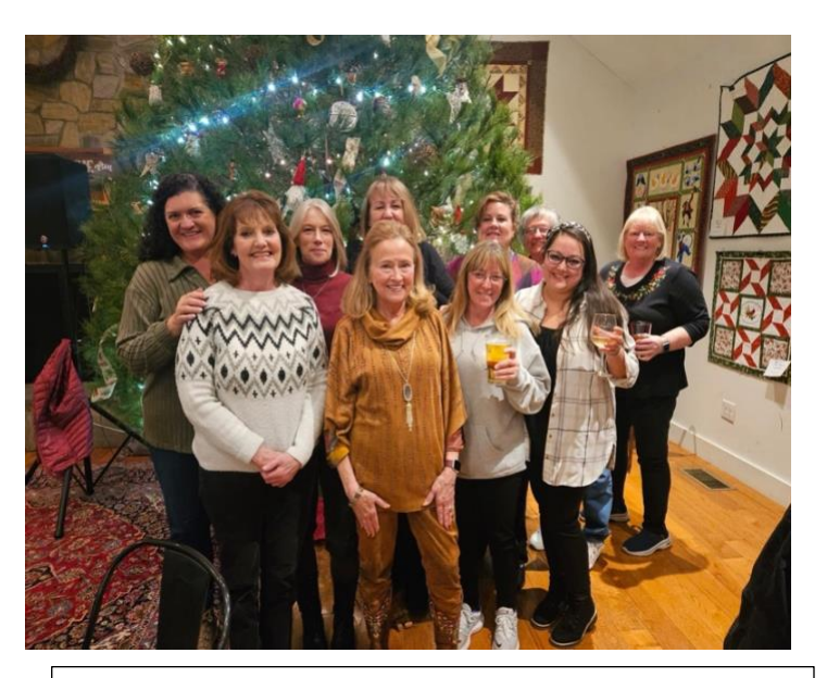
The Singles Group has some fun at Music Bingo at Cunningham Creek Winery!