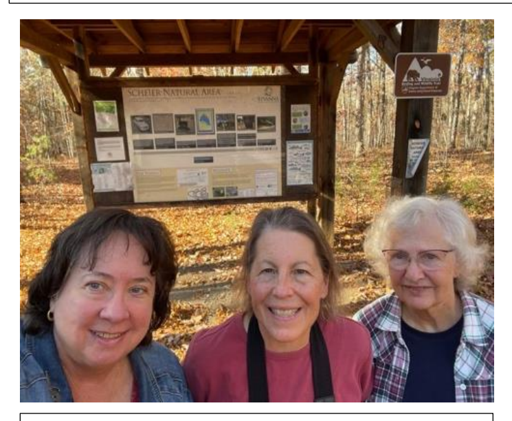
The Birdwatching Group met at Sheier Natural Area for an afternoon of birding.

New and revived Out to Lunch Bunch 4 enjoys a holiday luncheon at Well Hung Vineyard in Gordonsville! A rainy day kept us from shopping and spending money, but we still enjoyed great food and friends.