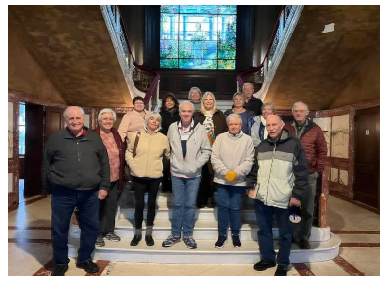
History Group Lucky 13 enjoyed an outing to Swannanoa near Afton, VA